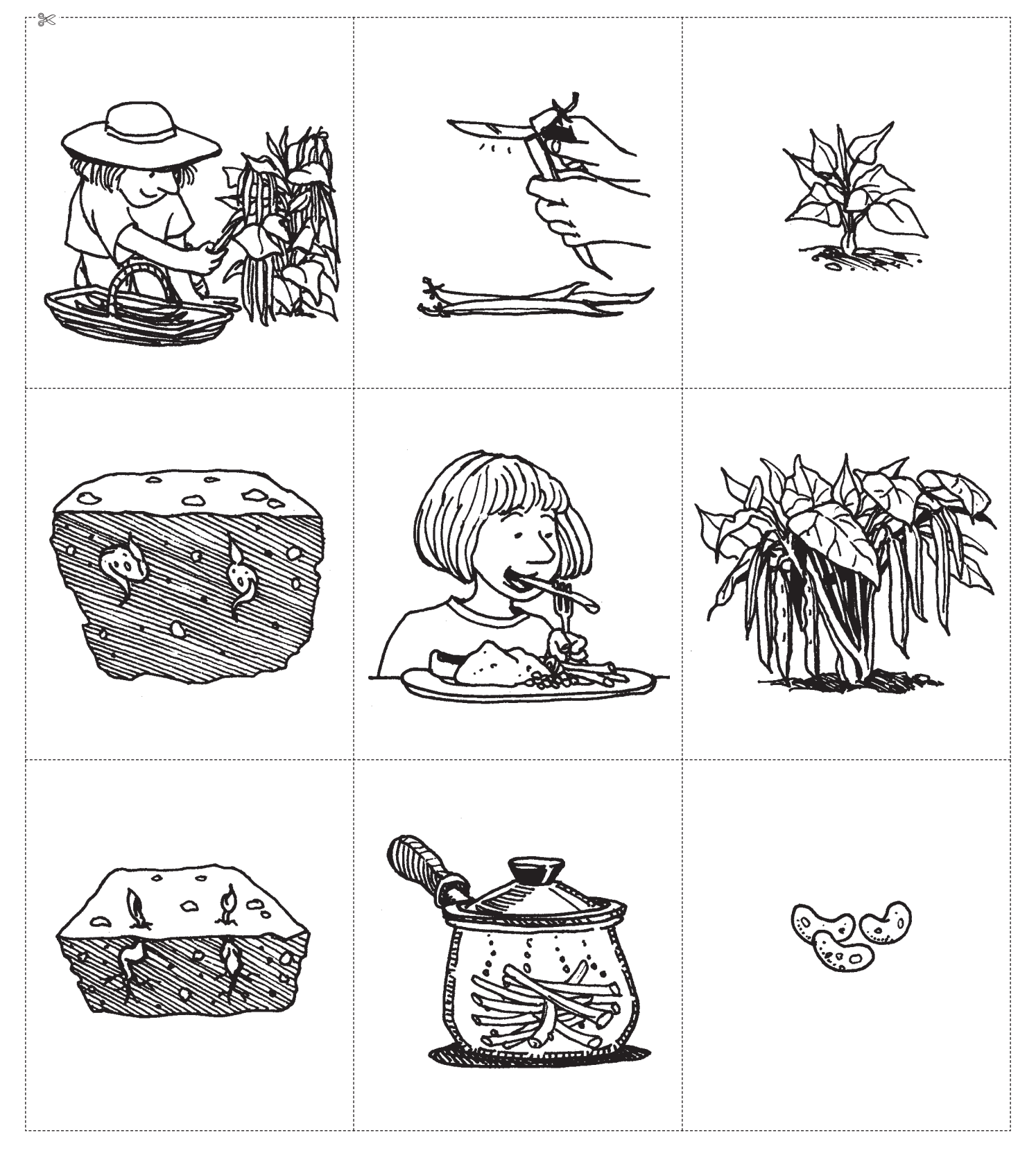
Instructions Ask the children to cut out each picture and paste in the correct order. Children could write a label for each picture.

Cut out these and put them in the right order.