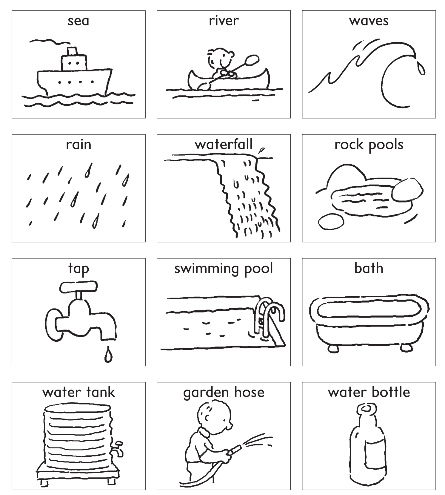
Instructions Ask children to use the words in the word bank to make a book about where we find water.

Make a book about where we can find water.