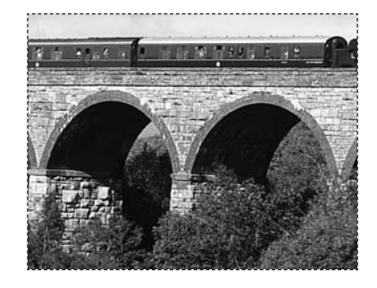
Instructions Remind children to use Bridges as a resource for sorting the pictures. In this open-ended task, the children can group the pictures in a variety of ways.