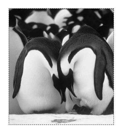
Instructions Remind children to use Looking After Eggs as a resource for sorting the pictures. In this open-ended task, the children can group the pictures in a variety of ways.